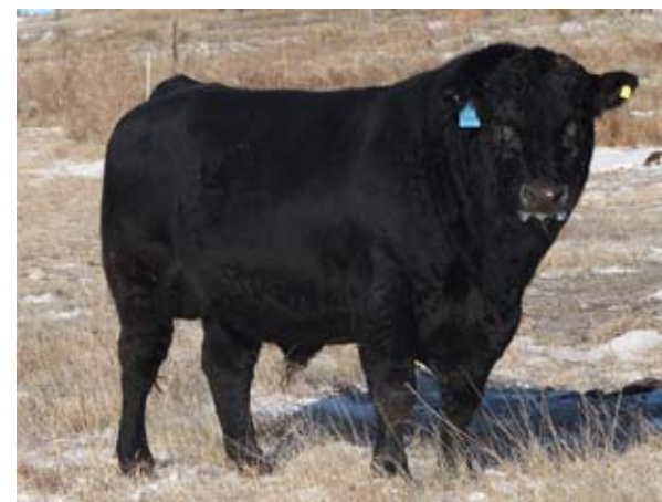
Sculptor of Amen GC in 2010

The 2 and 3 year old females sired by Sculptor are as consistent as any highly promoted Angus bull. Truthfully there are a lot of good Angus bulls but you can be assured Sculptor is an elite sire.