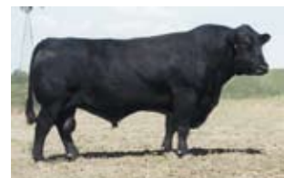
Sitz Alliance 6595