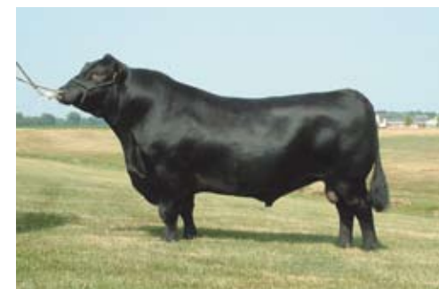
GAR Predestined Select Sires Top Angus Proven Sire