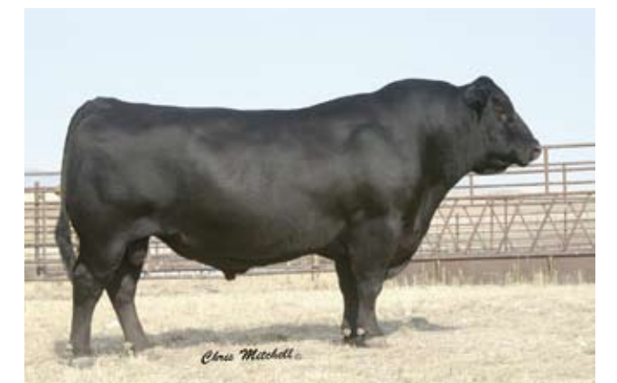
Kahn Broadband 94L